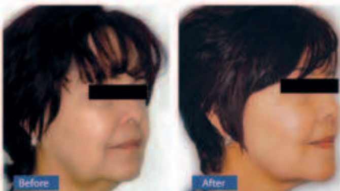
Prices from £85