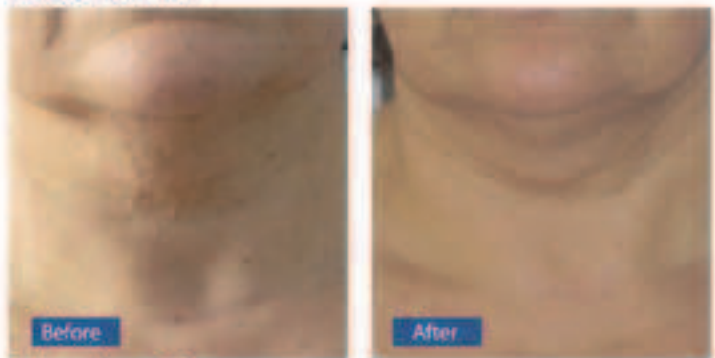
Prices from £50