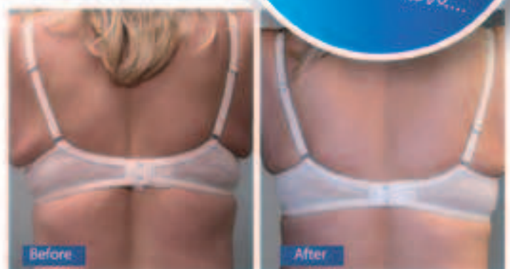
Prices from £65