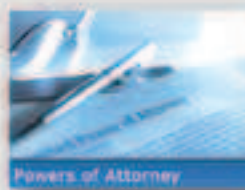
Powers of Attorney