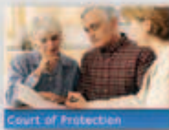
Court of Protection