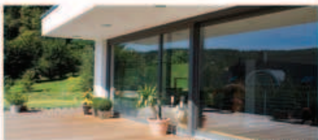
Modern cantilevered veranda

There is a current trend away from conservatories towards light and airy orangery style rooms that can be used all year round. These usually incorporate large sliding doors or folding screens to create an indoor / outdoor living experience.